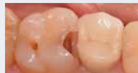
Cavity prepared and ready to be isolated with rubber dam

Professor of the Specialization Program in Paediatric Dentistry at the Scientific University of the South - Lima - Peru Co-author of three books on Paediatric Dentistry and several research papers