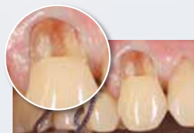
Cavity prepared and ready to be isolated with rubber dam

Professor in multiple Colombian universities International Lecturer in Biomaterials and Dental Aesthetics